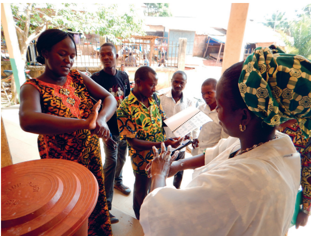
Photo: Training in proper hand-washing techniques.

Experts already predict that the economic fallout of COVID-19 for the continent will be severe, given that the estimated economic and social cost of the 2014 Ebola crisis in West Africa was US$53 billion [22]. The rapid spread of the COVID-19 across the world, combined with China's key role in the global economy (representing 18% of global GDP) and its large share of African infrastructure and capital projects (the lifeline of many African countries), will make it difficult for countries to sustain their own economic role in global manufacturing and supply chains.