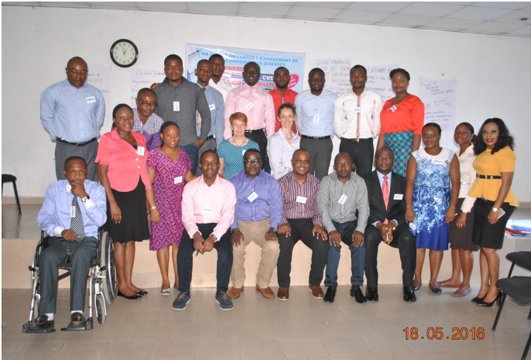
PHOTO 18: Group photograph (3)