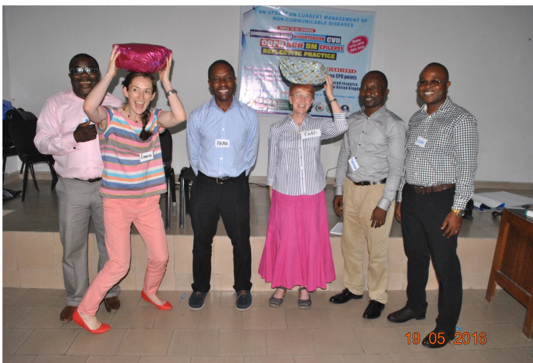
15: Presentation of gifts to trainers from UK (2)